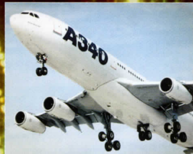
High product quality